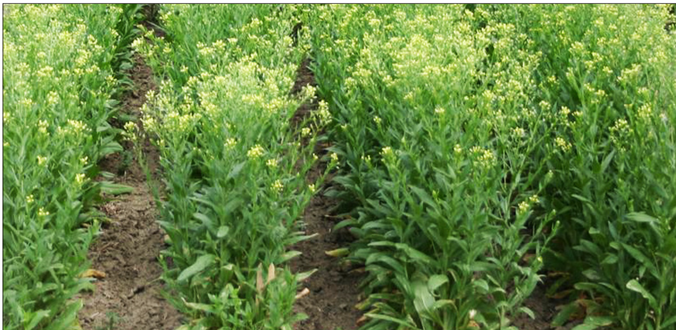
FIGURE 2. Camelina plants bloom with small, four petal, yellow flowers.

Concurrently camelina meal is being fed to 2 and 3 year-old beef cows to evaluate the potential to use the meal as a protein and energy source for breeding beef cattle. The objective of the trial is to determine if the beneficial effects seen in humans from consuming elevated levels of omega-3 also occur in beef cattle. If camelina meal can effectively be utilized for production of omega-3 enriched beef, beef will constitute the largest single market for camelina meal in Montana. For more information contact Darrin Boss, Northern Agricultural Research Center, Havre, MT.