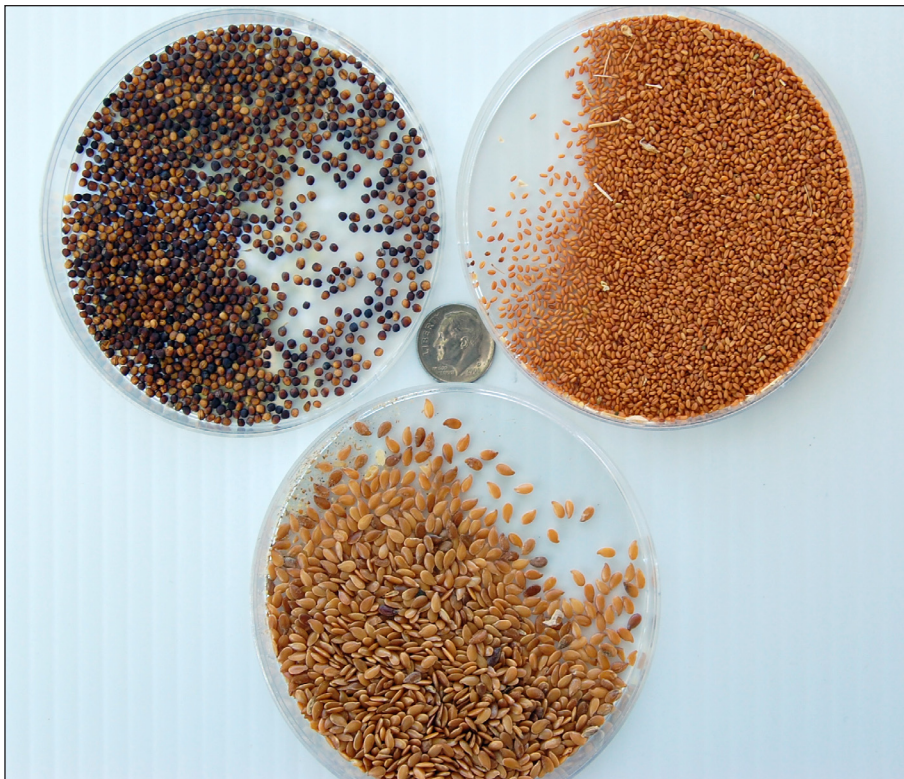
FIGURE 4. Camelina seed (upper right) is very small as compared to canola (upper left) and flax seed (bottom).

Seed characteristics of camelina are different than those of other oilseed crops. Camelina is a very small seed (see Figure 4), but it does not roll like canola or flow like flax. Filling cracks by taping or caulking truck beds and storage bins should be done prior to harvest to prevent seed loss. To date, there have been no reported observations of insect damage to seed occurring during bin storage. Currently no bin insecticide treatments are registered for use on camelina seed, therefore none should be used.