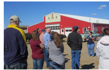
Farmer's Union tour NARC