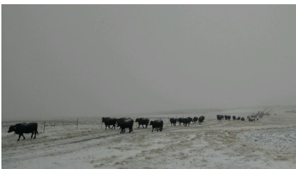
Bringing the cows home January 2016