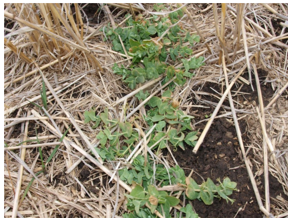
Sept 2015 seeded winter peas on Mar 29, 2016