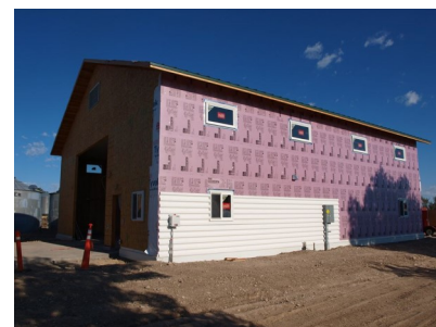
CARC Farm Shop Building