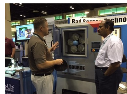
Discussing the 4 pi-X-ray