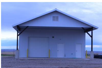
WTARC Pesticide Storage Facility