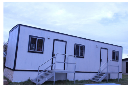
WTARC Lab/Office Modular