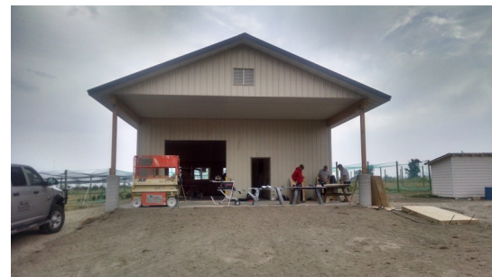
WARC Pesticide Storage Facility