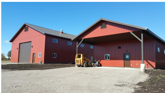
NWARC Pesticide Storage & Shop buildings

This year many of the research centers, and the Post Farm in Bozeman, have been the recipients of new Pesticide/ Chemical Storage and Handling Facilities and Shops. It has been exciting to see construction progress and we are grateful for the Legislative support in the creation of these much needed facilities.