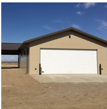
NARC Pesticide Storage Facility