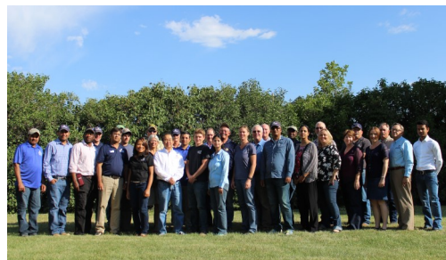
DRC Family - Summer Conference at the SARC

My congratulations to the DRC faculty for their grant and contract activity in FY16. Research expenditures for the Department were $874,076 in FY14, $1,126,184 in FY15 and $1,899,640 in FY 16! On a per FTE basis grant activity was $146,126 in FY16. This compares favorably with both LRES and Plant Sciences and Plant Pathology faculty and much higher than faculty in Animal and Range Sciences and Agricultural Economics. Based on activity year to date I expect that DRC will set another record for grant and contract based research expenditures.