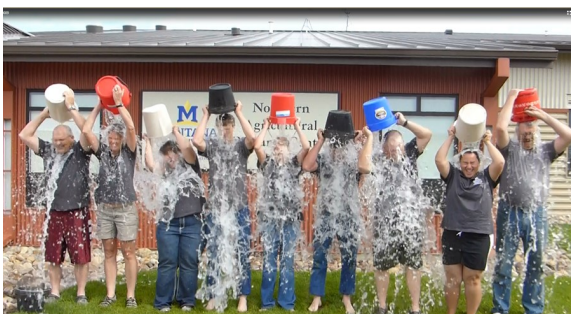
NARC braving the ALS Ice Bucket Challenge