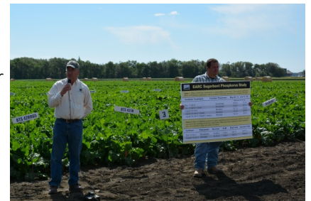
Presentation at the EARC Field Day