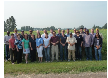
DRC Faculty and Staff at Summer Conference held July 18 & 19th at the Northwestern ARC - Kalispell