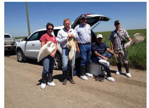
The Orange Wheat Blossom Midge biological control team visits Alberta

certainly have additive value in effectively controlling the midge populations in Montana. By doing adapting biological control methods for control of insect pests, the environmental benefits of reduced pesticide application will not only be an additional bonus, but will also help in beneficial parasitoids establishment.