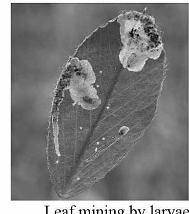
Leaf mining by larvae