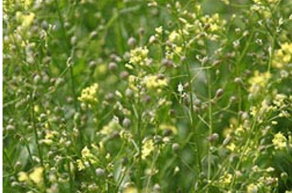
1, Camelina sativa

Contributed by: USDA NRCS WA Plant Materials Program