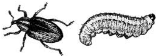
Alfalfa weevil adult, left; larva, right.