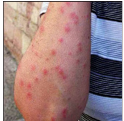
FIGURE 2. Bite welts. ( urbanentomology.tamu.edu/bedbugs.cfm )