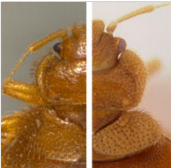
FIGURE 4. Bird bugs (left) and bat bugs (not shown) have longer body hairs than bed bugs (right).

The distinction is an important one because control efforts differ. Unlike bed bugs, bat bugs and bird bugs occur solely in the vicinity of nesting birds or roosting bats. Mitigation requires locating and removing bird nests under eaves of houses and sheds, and screening roosting bats out of attic spaces and wall voids. Bird nesting boxes should never be attached to exterior walls of houses. These look-alike species will eventually disappear once host nesting activities are disrupted, although attacks on humans can occur as the insects disperse. Neither bat bugs nor any of their close relatives have been shown to transmit human diseases.