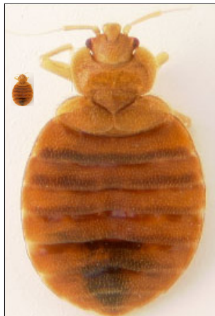
FIGURE 1. Adult bed bug.

Similar-looking species of “bat bugs” and “bird bugs” in the same insect family (Cimicidae) can also bite humans. In our region these include the western bat bug, Cimex pilosellus , and the swallow bug, Oeciocampus vicarius . Magnification is required to distinguish these look-alikes from bed bugs. When viewed on its back, the left side of an adult female bed bug has a narrow, pointed notch (“paragenital sinus”) on the fourth visible abdominal segment (Figure 3, page 2). The female bat bug (no image) also has a notch, but it has a rounded