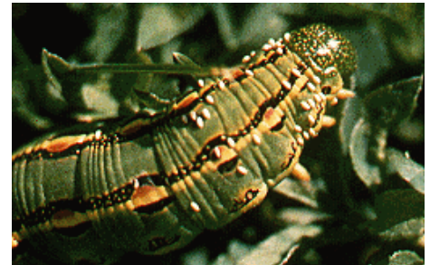
Figure 9: Tachinid fly eggs (white) laid near head of hornworm caterpillar.