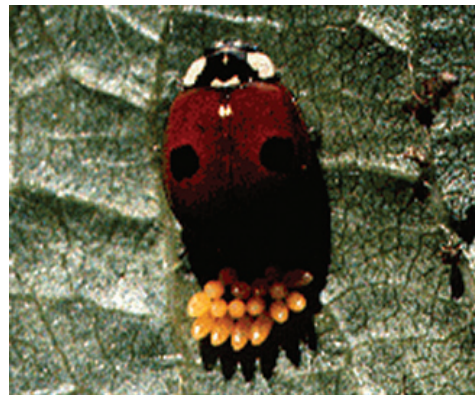
Figure 1: Twospotted lady beetle laying eggs.

One species of lady beetle, however, the Mexican bean beetle, is a plant pest. This