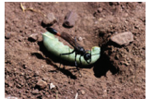
Figure 7: Hunting wasp ( Ammophila ) at prey with caterpillar.

Several mite species are predators of plant-feeding spider mites. Typically, these predatory mites are a little larger than spider mites but are more rounded in