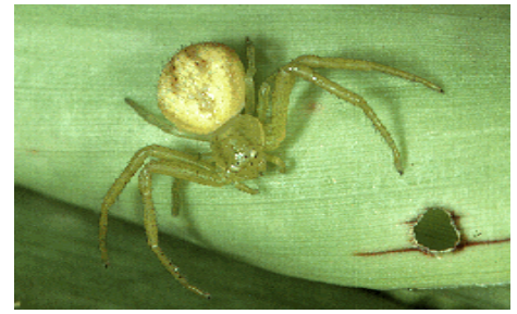
Figure 8: Crab spider.

Many insects are important in the biological control of plant pests have special food needs during their adult stage. An important example of this are syrphid (flower) flies that must feed on pollen or nectar to mature eggs. Many other insects use pollen and nectar (and honeydew) to sustain them, often allowing them to survive longer, produce more progeny and provide an overall higher level of biological control. Lady beetles, green lacewings and parasitic wasps are among the natural insect enemies that utilize nectar and pollen in this manner.