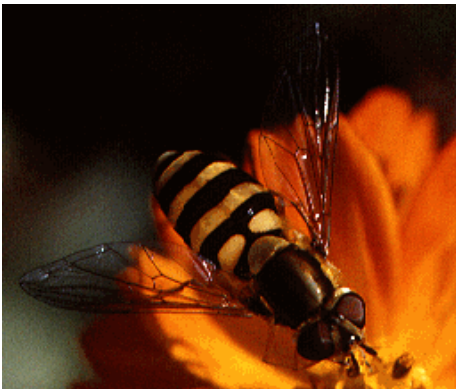
Figure 5: Syrphid fly adult.