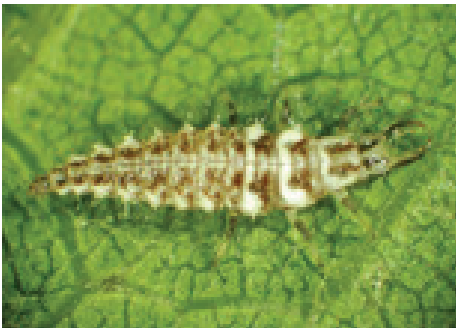
Figure 4: Green lacewing nymph.