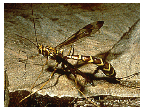
Figure 11: Ichneumon wasp.