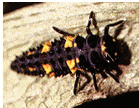
Figure 2: Typical lady beetle larva.

common Colorado insect is found feeding on bean leaves. It is distinguished from other lady beetles by spotting and color in the adult stage. Larvae of the Mexican bean beetle are yellow and spiny.