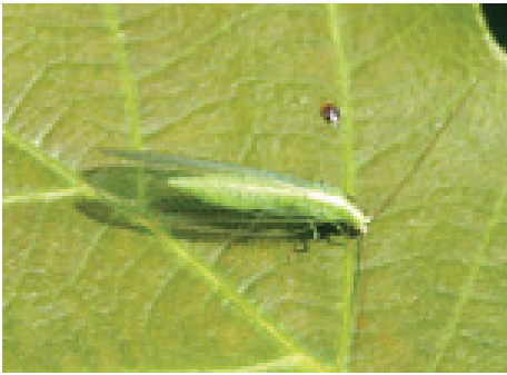
Figure 3: Green lacewing adult.