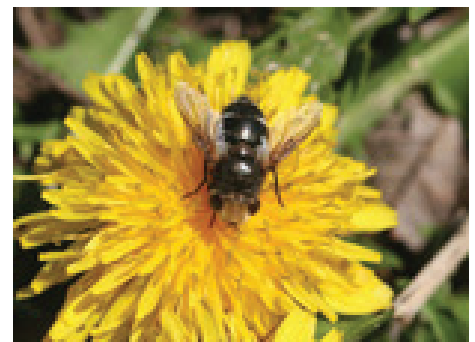
Figure 10: Tachinid fly feeding on nectar.