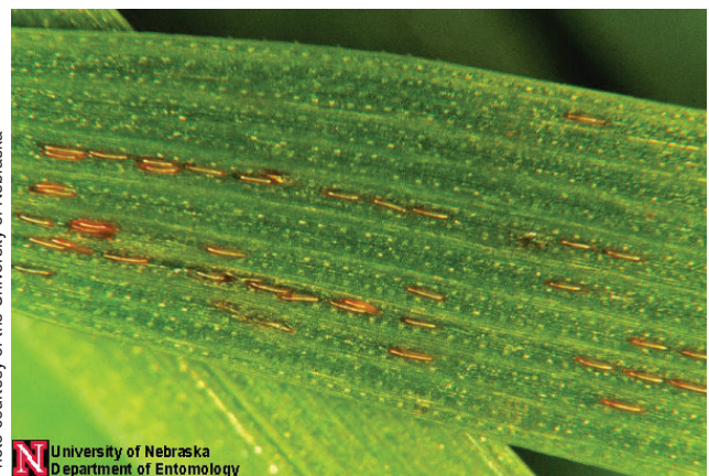
Figure 2. Hessian fly eggs are laid on the upper side of a wheat leaf between the veins. Note the orange color of the eggs are similar in color to leaf rust.

Hessian fly completes its lifecycle in about 40 days to 50 days, but once the "flaxseed" stage is reached, it may remain dormant for three months to four months. After emergence and mating, the female fly lays eggs in between the leaf margins of its host plant. Newly hatched larvae crawl down the plant and begin feeding in the area between the sheath and stem just above the crown, just below the soil surface (fall) or between the stem and leaf sheath at the first node above the soil surface (spring). The fall generation overwinters as flaxseed, emerging in spring; the spring generation oversummers as flaxseed in wheat stubble, emerging in the fall.