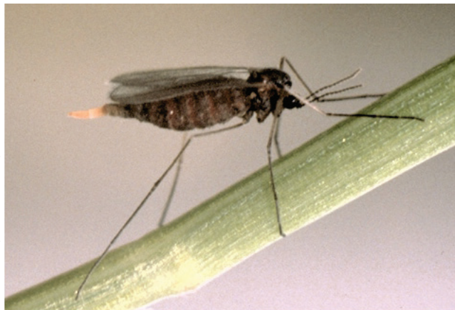
Figure 1. Adult female Hessian fly.

Hessian fly eggs are oblong, orange, measure less than 1/50 inch and can be mistaken for early signs of leaf rust.