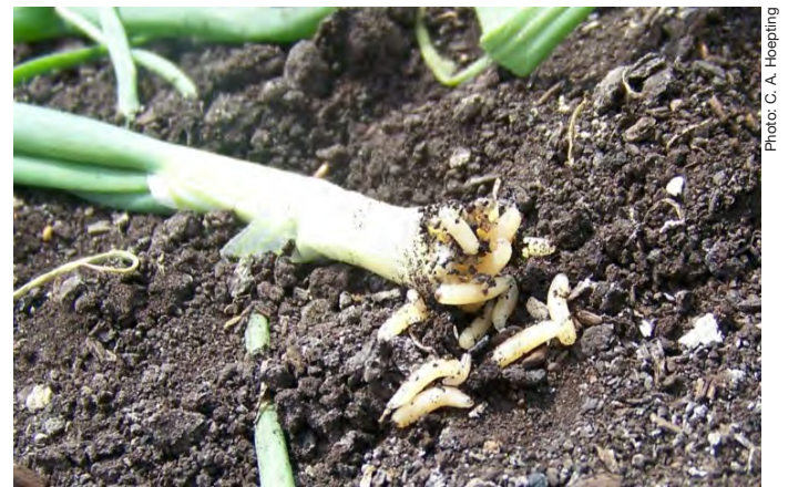
Figure 3. Damage to a young onion plant by onion maggot larvae.

Rotating onions to fields that are as far away as possible ( \geq 1.2 km / \geq 0.75 mi) from the previous season's onion crop will reduce onion maggot populations and the resulting damage by "escaping the infestation in space" 7 . Planting onions midway or late in the onion planting period (late-April to mid-May) will reduce maggot damage to plants by "escaping the infestation in time" 2 . While planting too late in the season can result in a higher risk of the crop producing undersized bulbs, this tactic could be used in fields that have a chronic history of high onion maggot populations. Removing cull onions from the field after harvest and fall plowing will help reduce the number of overwintering flies.