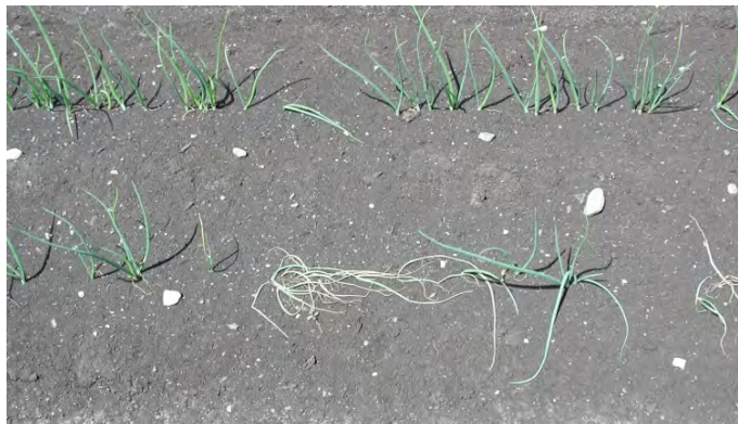
Figure 2. Damage to onion seedlings by onion maggot larvae.

As the crop grows, the relative attractiveness of these traps decreases, lessening their accuracy in predicting second generation population activity. Yellow sticky traps placed around field edges just above the growing foliage can also be used to monitor fly activity 5 . Monitoring the cone or sticky traps once a week should aid in determining