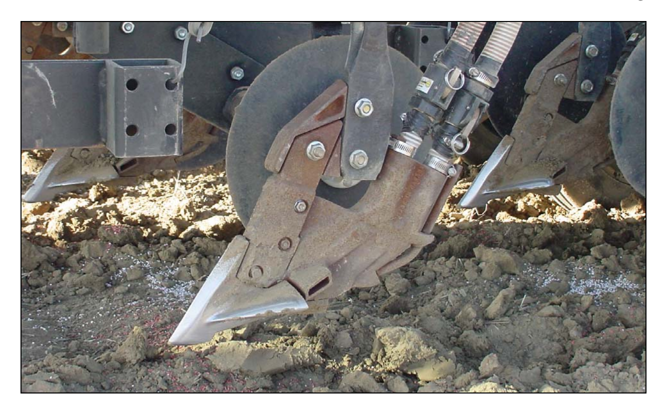
Figure 11a. GEN T2x2