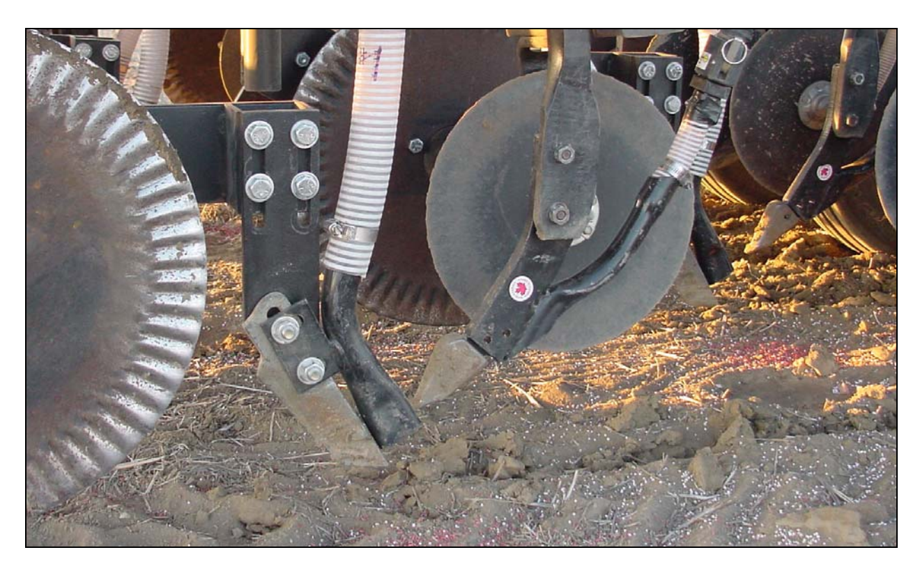
Figure 6a. DUTCH SUPER EAGLE w/FARMLAND Mid-Row Fertilizer Banding Disk