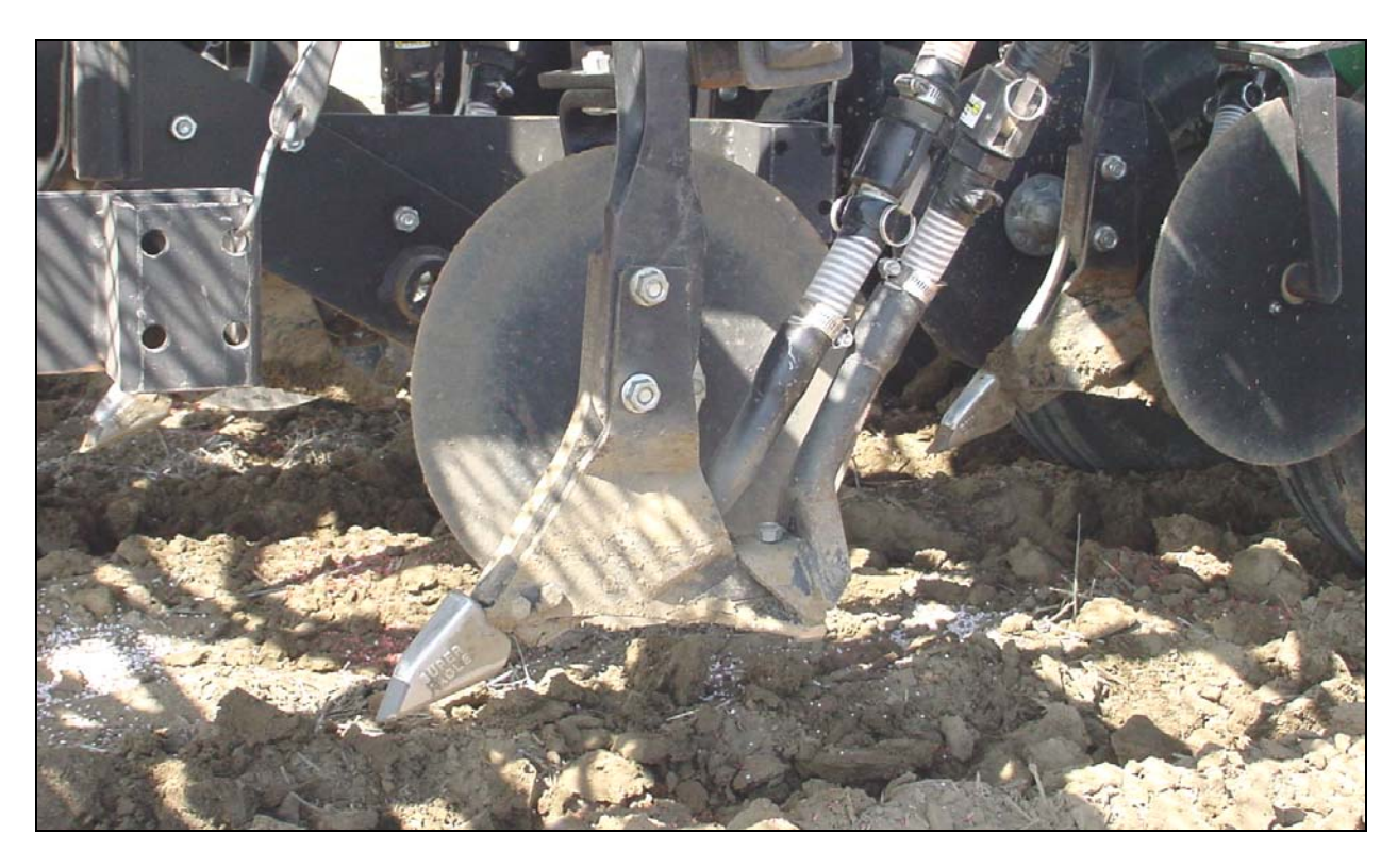
Figure 3a. DUTCH SUPER EAGLE w/3.5" Paired Row Attachment