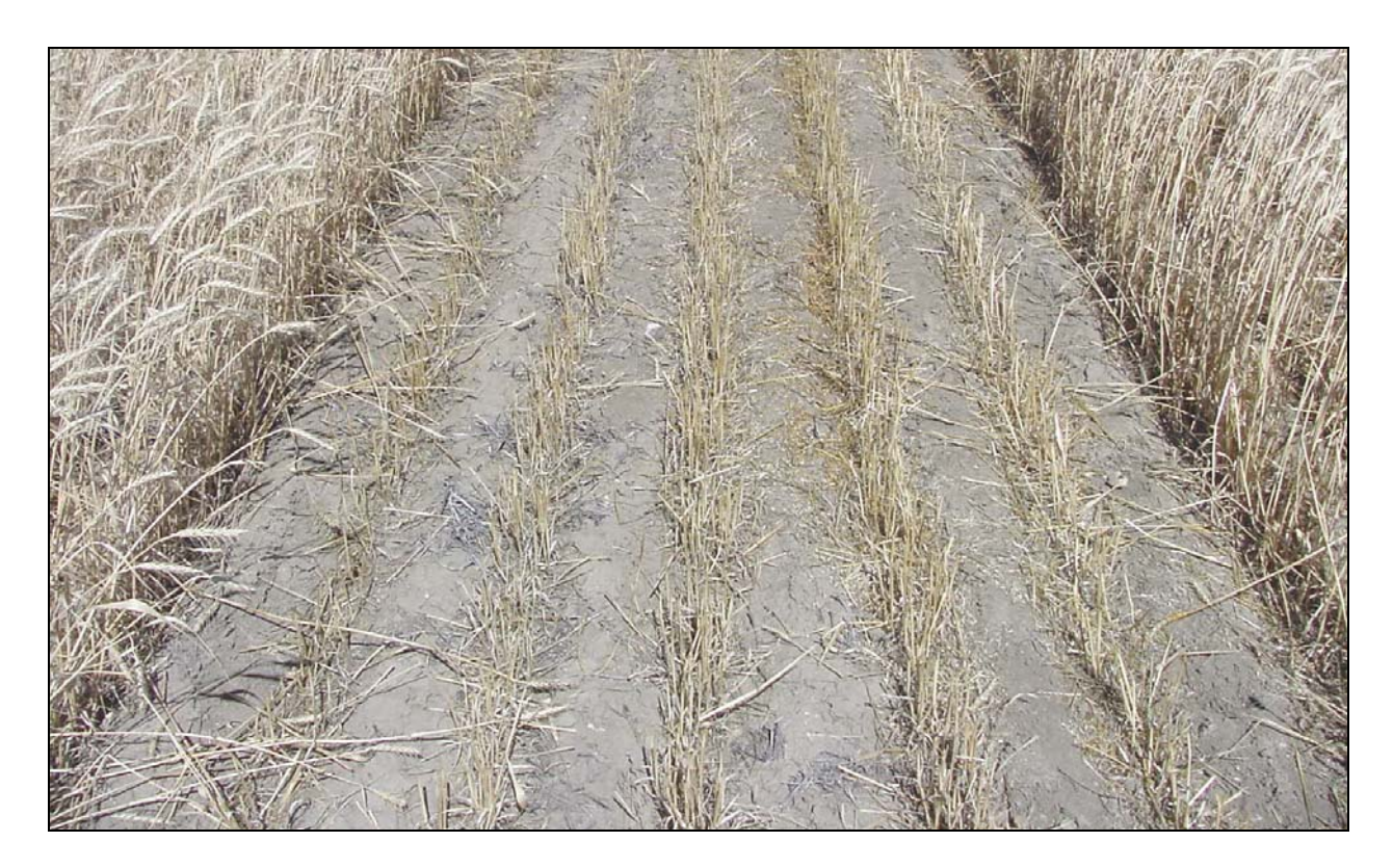
Figure 10b. Post-Harvest, Solid, Seed Band Width = 3.8 Inches