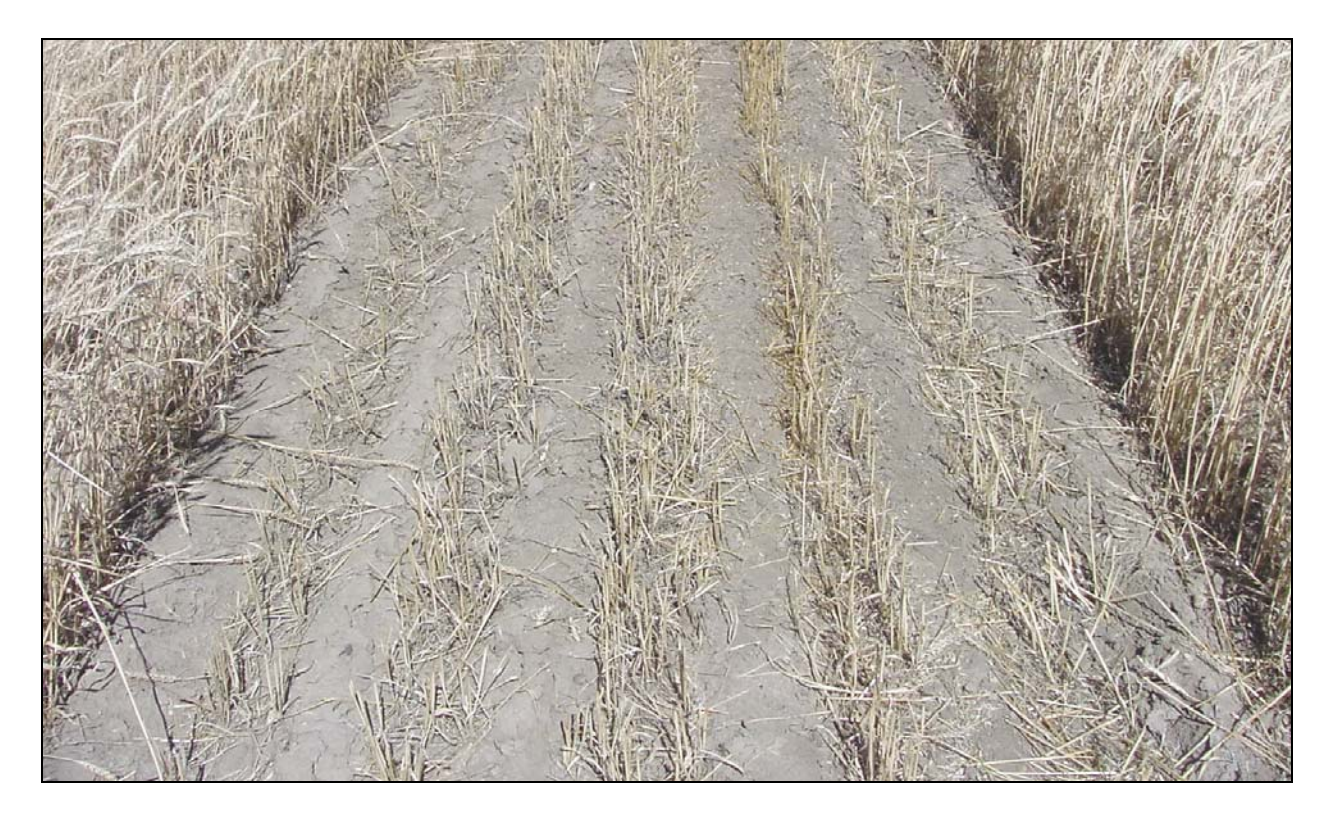
Figure 9b. Post-Harvest, Solid, Seed Band Width = 5.7 Inches