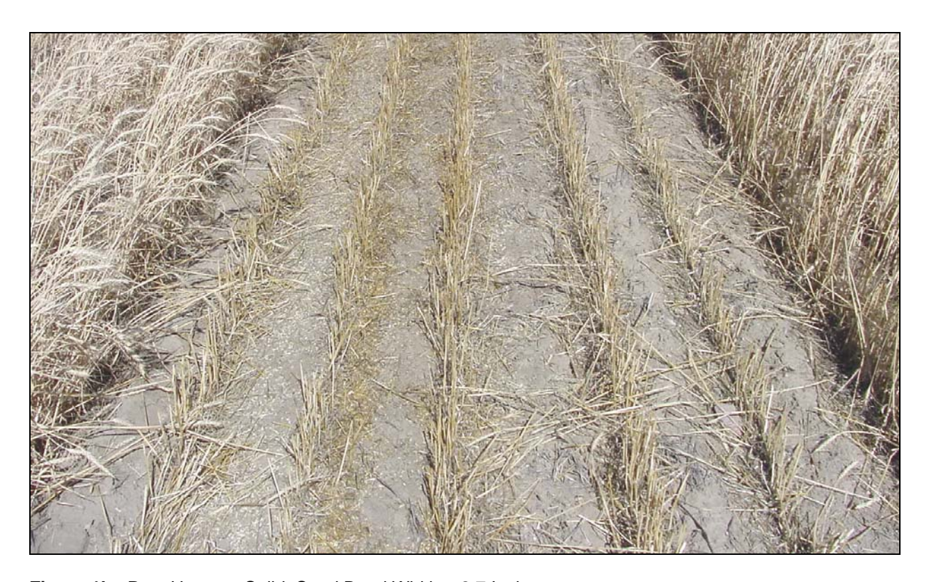
Figure 1b. Post-Harvest, Solid, Seed Band Width = 2.7 Inches