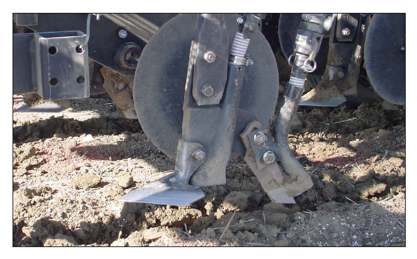
Figure 7a. FARMLAND LOW DISTURBANCE (LD) w/Case-McKay 6" LD Sweep & K3 Backswept Knife