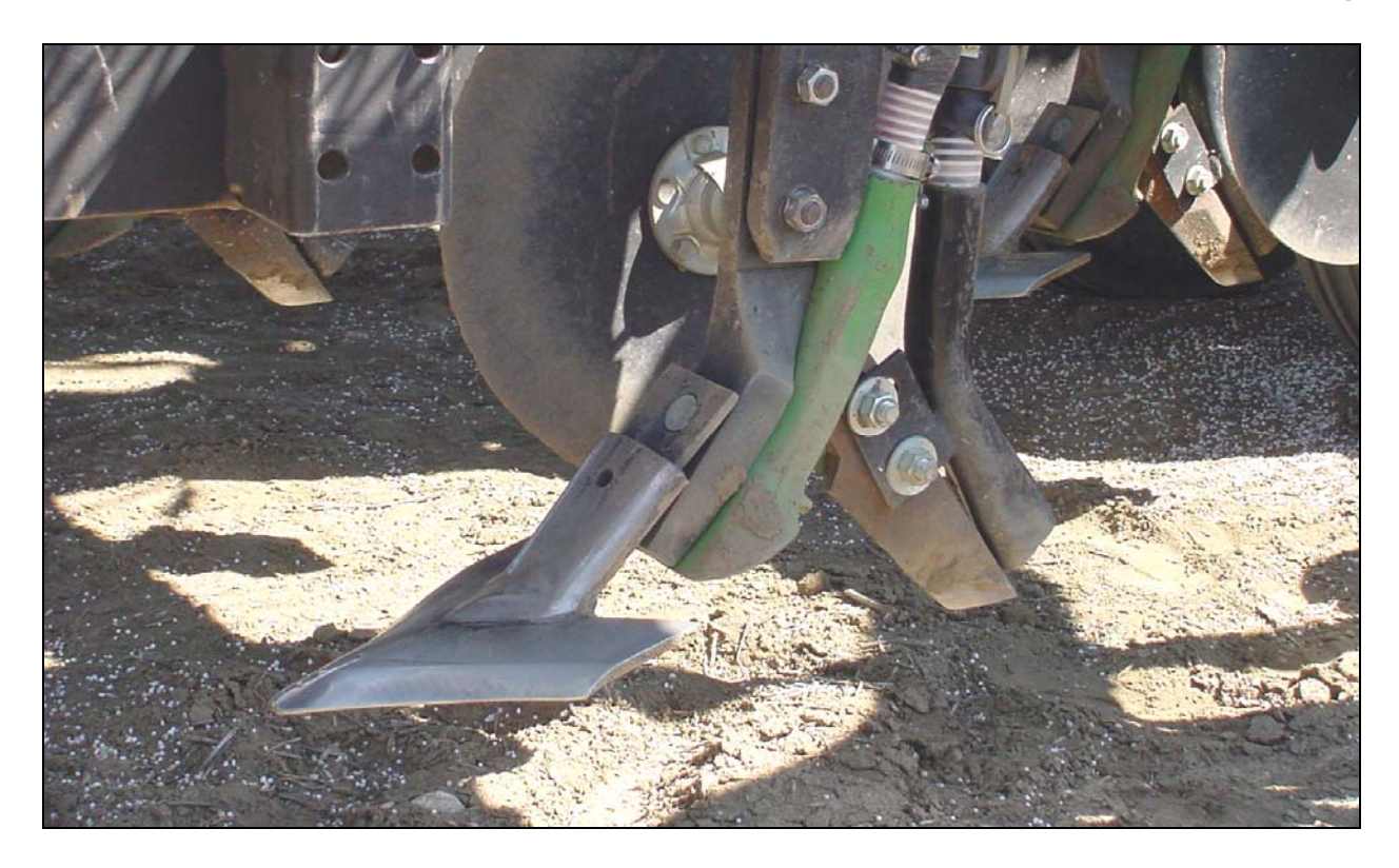
Figure 9a. FARMLAND SB1-SBS1 w/6" Knock-On Sweep & K3 Backswept Knife