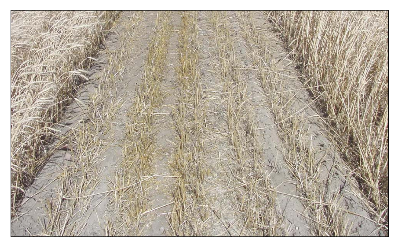
Figure 2b. Post-Harvest, Paired-Joined, Seed Band Width = 5.9 Inches