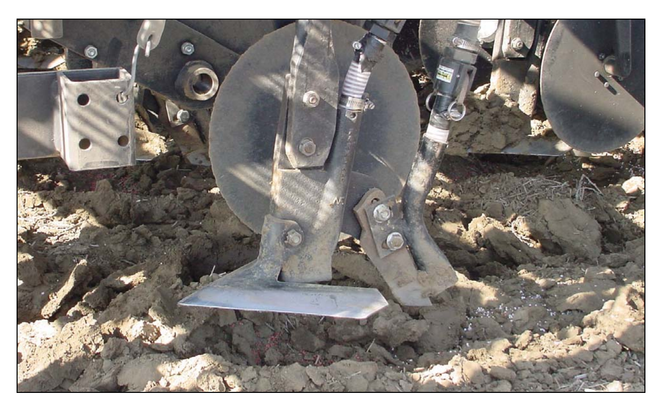
Figure 8a. FARMLAND LOW DISTURBANCE (LD) w/Case-McKay 11" LD Sweep & K3 Backswept Knife