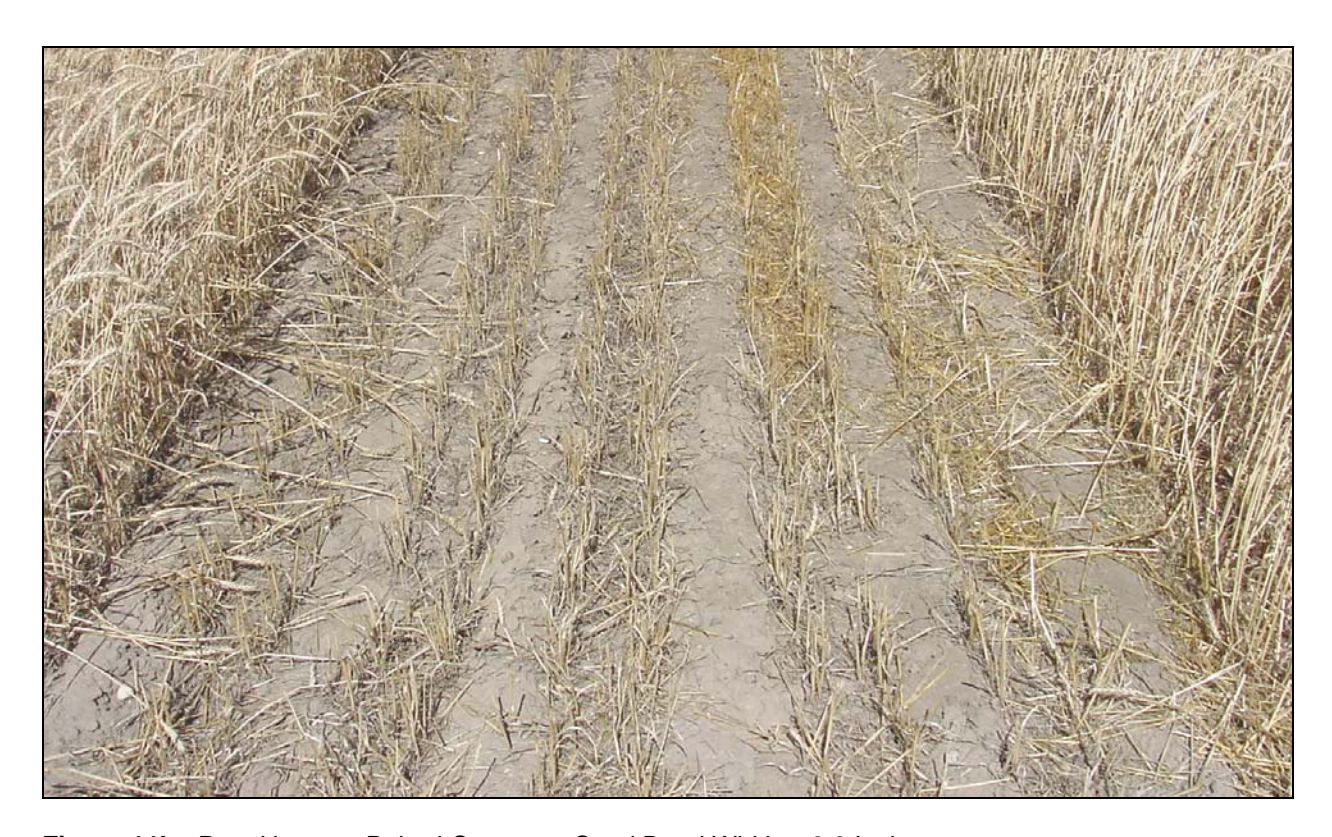
Figure 11b. Post-Harvest, Paired-Separate, Seed Band Width = 6.9 Inches