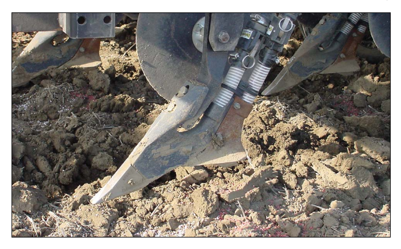
Figure 10a. FLEXICOIL STEALTH w/Paired Row Attachment