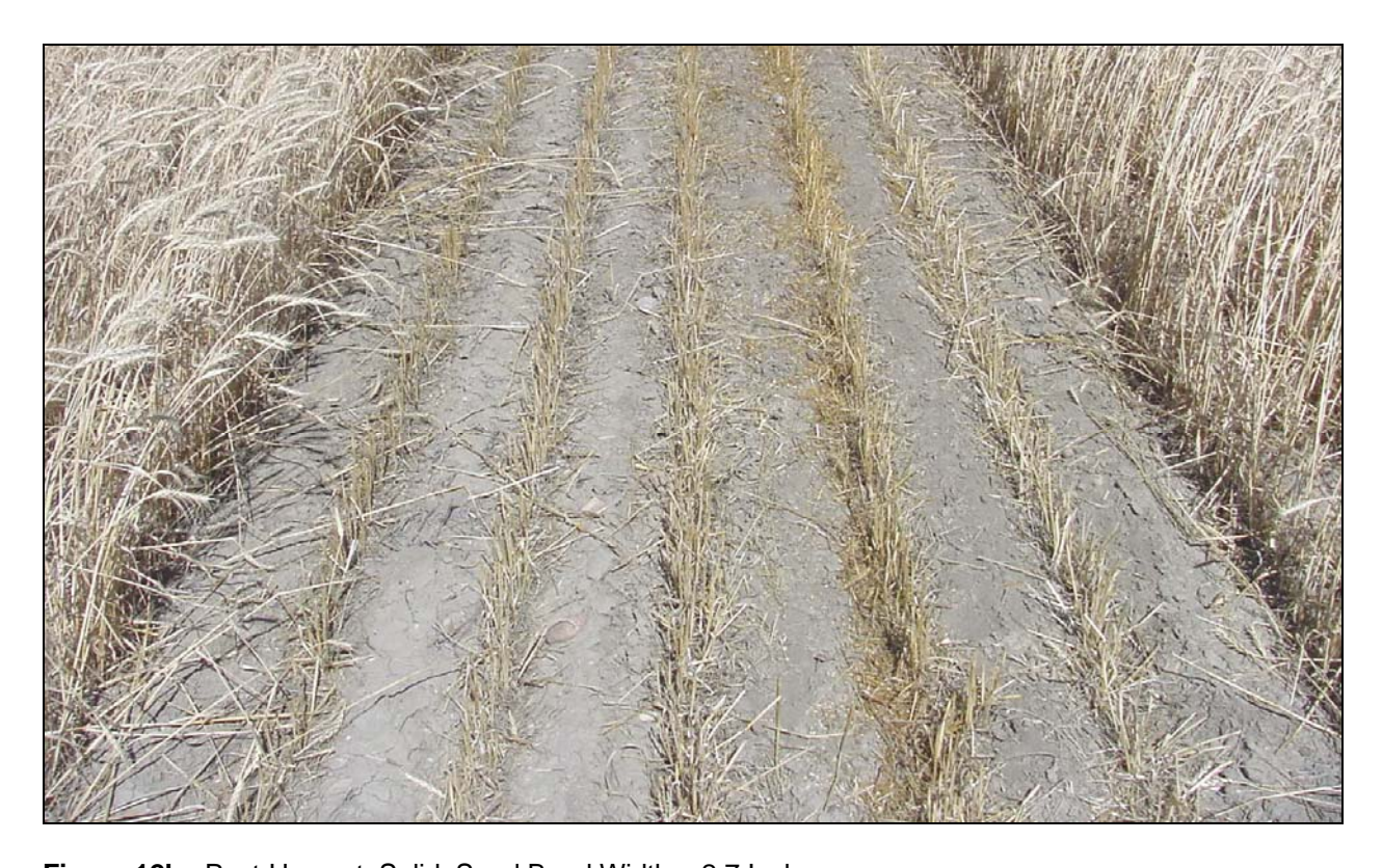
Figure 12b. Post-Harvest, Solid, Seed Band Width = 2.7 Inches