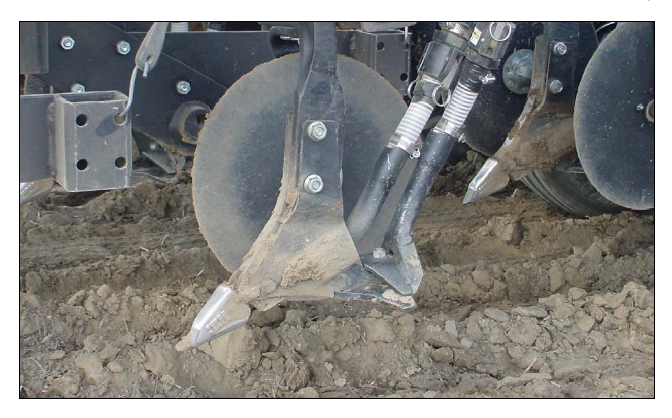
Figure 4a. DUTCH SUPER EAGLE w/5.5" Paired Row Attachment