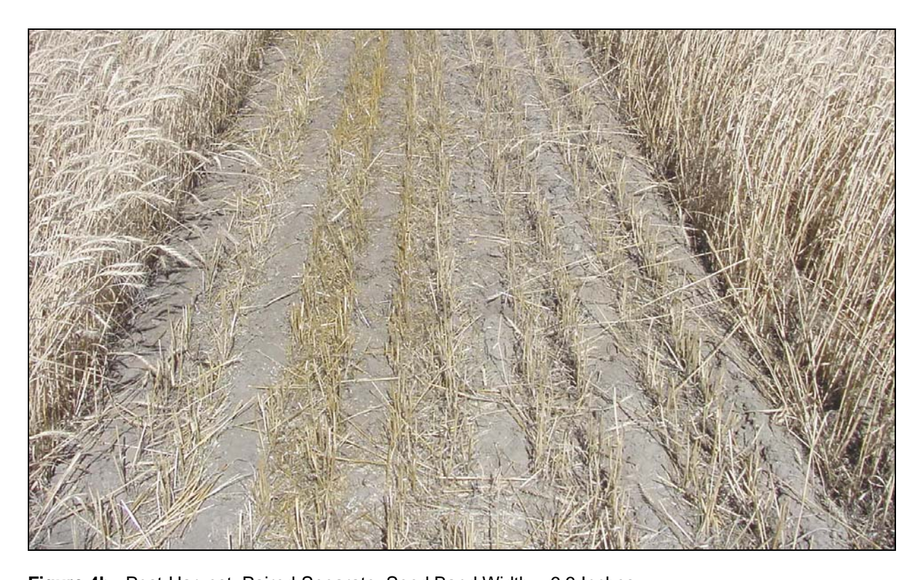
Figure 4b. Post-Harvest, Paired-Separate, Seed Band Width = 6.3 Inches