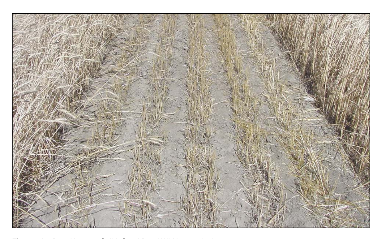
Figure 7b. Post-Harvest, Solid, Seed Band Width = 6.3 Inches