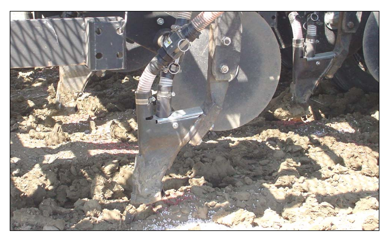
Figure 2a. ATOM JET (HarvesTechnologies) 4" Paired Row