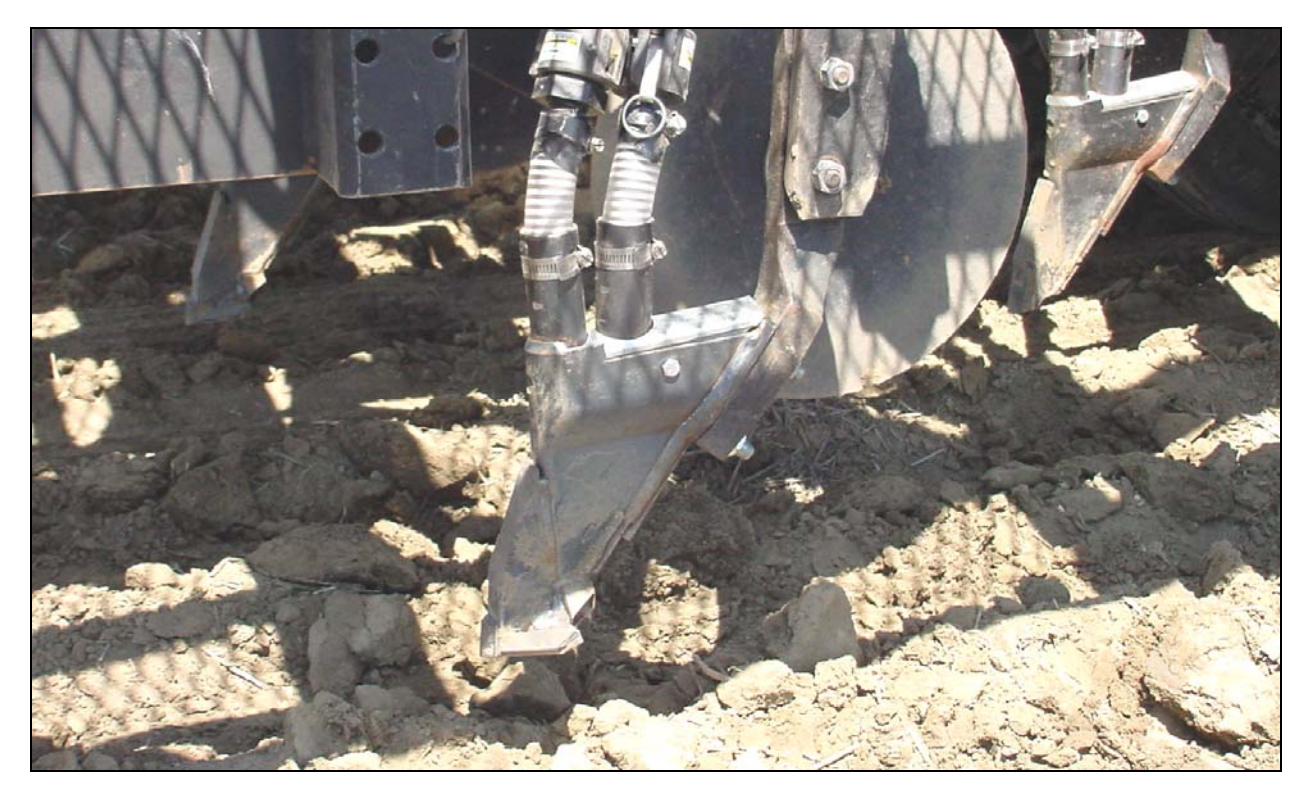
Figure 1a. ATOM JET (HarvesTechnologies) Side Band