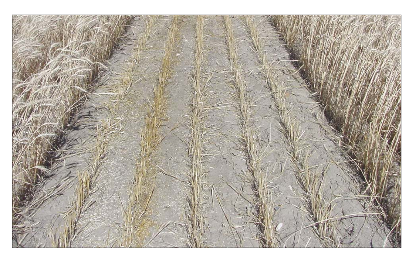
Figure 6b. Post-Harvest, Solid, Seed Band Width = 2.9 Inches