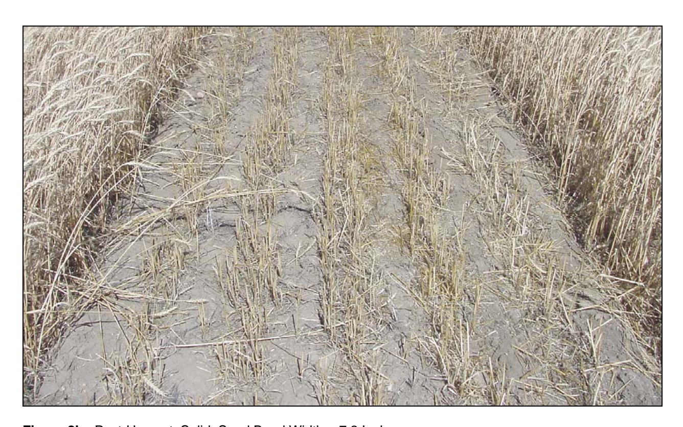
Figure 8b. Post-Harvest, Solid, Seed Band Width = 7.2 Inches