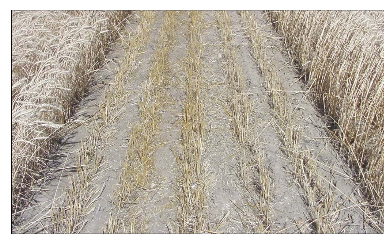
Figure 5b. Post-Harvest, Solid, Seed Band Width = 4.9 Inches