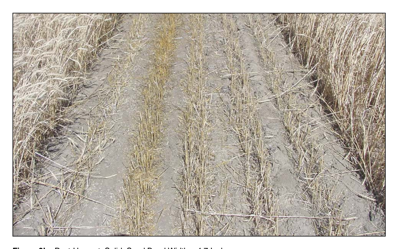
Figure 3b. Post-Harvest, Solid, Seed Band Width = 4.7 Inches