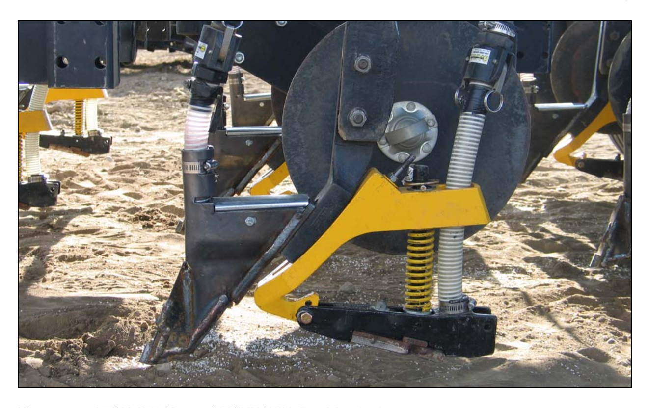
Figure 12a. ATOM JET CB-15 w/TECHNOTILL Precision Packer