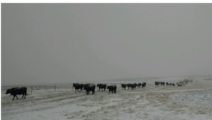
Bringing the cows home January 2016