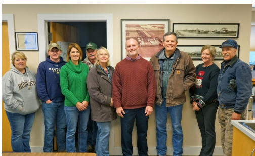
CARC faculty and staff with Senator Daines

In other news, the CARC had an unexpected visitor to the center in December. Senator Steve Daines made an ad hoc visit to speak with staff and see what work is done there. Staff had the opportunity to discuss agriculture research conducted at the center and the important role it has both locally and statewide.