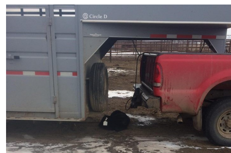
Seeking shelter from the cold