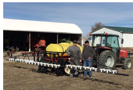
WeedSeeker Sprayer mounted on tractor