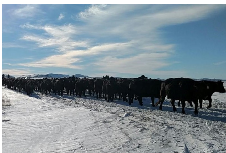
Bringing the cows home 2017