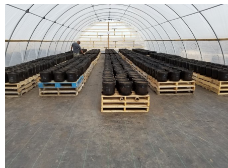
Current trial being conducted in new greenhouse facility at the WTARC