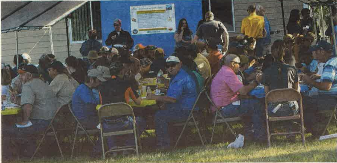
The 2016 Western Triangle Research Center located near Conrad kicked off their Field Day on June 23rd with an industry sponsored breakfast for all attendees. Special guests included representatives of various departments and colleges at MSU, WTARC Advisory Committee Members and Ag retailers and growers.

JULY 2016 Vol. XVII No. 6 P.O. Box 997 Conrad, MT 59425-0997 Phone 406-271-5533 Fax 406-271-5727 Website: tradersdispatch.com E-MAIL: trader@3rivers.net