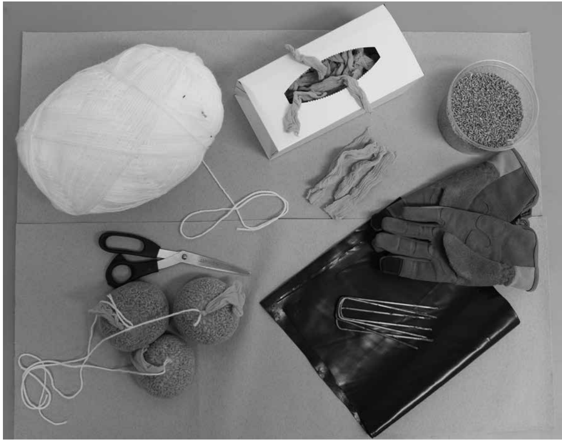
The wireworm sampling device "stocking traps".