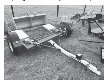
2013 Stehl tow dolly 6000 lb. with straps, like new, used once $1250