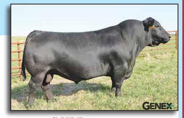
SAV Resource CED -1 BW +4.2 WW +70 YW +134 Milk +18