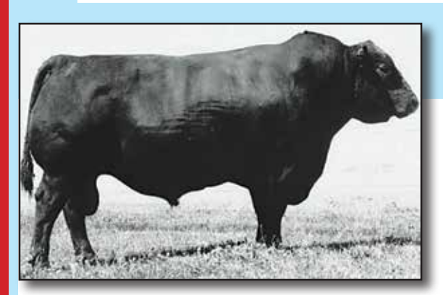
RR Rito 707 CED 0 BW +1.6 WW +19 YW +25 Milk +7