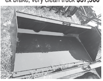
New 84" large cap SS bucket with bolt-on edge.....$900