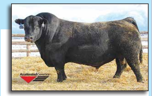
CED +11 BW -.4 WW +50 YW +91 Milk +25