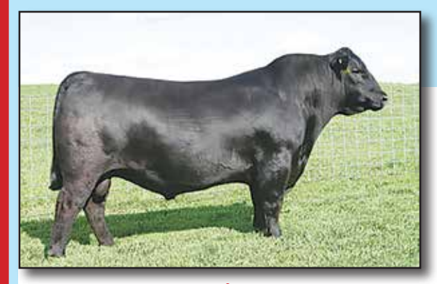
SAV Bismarck CED +12 BW +1 WW +53 YW +89 Milk +9