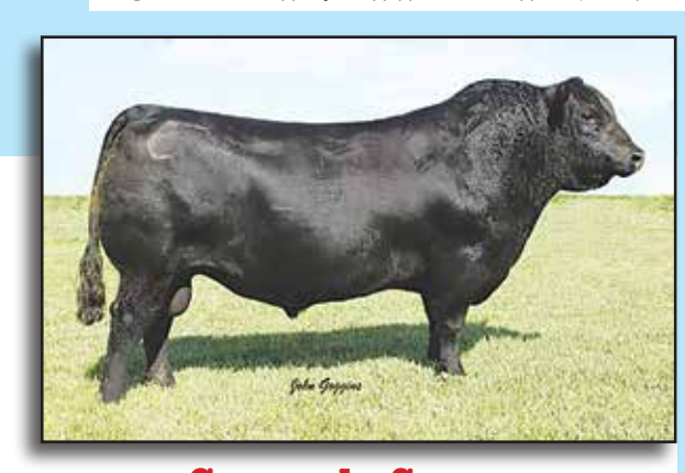
Connealy Spur CED +8 BW +3 WW +68 YW +117 Milk +34