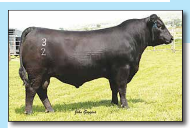
Connealy Countdown CED +10 BW +.2 WW +60 YW +101 Milk +10