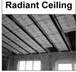
SmartRooms Electric Radiant Heating Systems

The difference between heat and comfort with Green products from SmartRooms