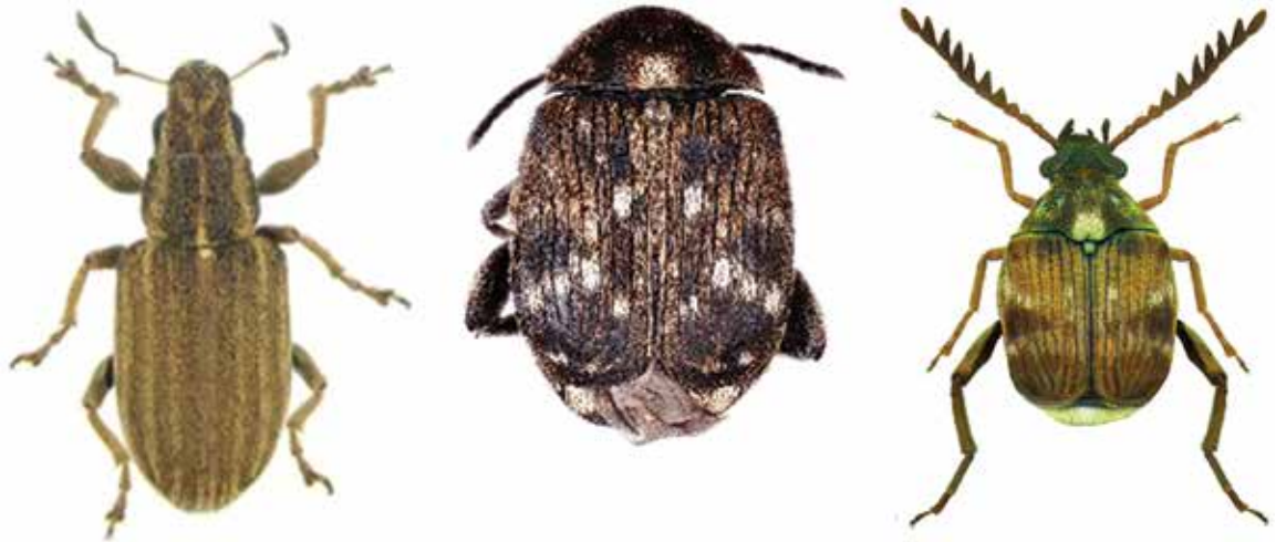
Figure 1. Adults of pea leaf weevil, pea weevil, and cowpea weevil (for cow pea weevil,)