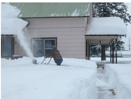
NWARC was buried in snow January 5th

The Center has been busy planting the fields, which has been very welcome considering the winter they had. One storm in particular brought 24 inches of snow over the course of a day! They then had to battle ice dams following that system...thank goodness for spring!