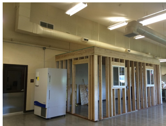
NARC Lab renovation project