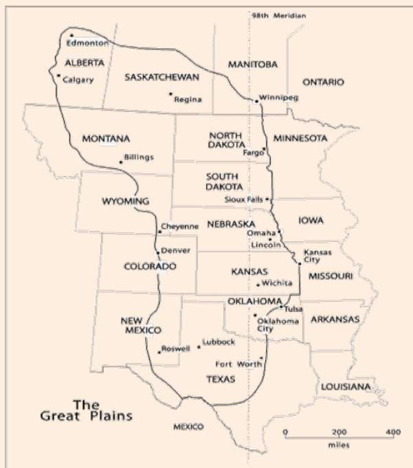
Figure 1: Map showing the US Great Plains. ( http://www.unl.edu/plains/about/map.shtml ).

In recent years, introduction and adoption of reduced tillage (RT) and no-till (NT) practices have led to increased moisture storage and allowed crop intensification in most regions of the GP. For example, precipitation storage efficiency in a NT, WF system was 35% compared to 20% in a CT, WF cropping system [5]. Over 75% of precipitation received during the fallow phase of WF system is lost to evaporation, runoff, deep percolation and weeds [6]. Replacing fallow with frequent cropping will increase the amount of residue returned to the soil, protect the soil against wind and water erosion and potentially increase nutrient cycling through SOM decomposition. Economically, intensive cropping combined with RT has been shown to be more profitable compared to WF systems in the GP [7,8].