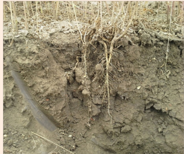
Figure 2: Soil profile distribution of camelina roots at an experimental site in Wyarno, near Sheridan, WY.

Camelina is indigenous to northern Europe. It is also known as 'gold-of-pleasure' or 'false flax' and belongs to the mustard family. Popularity of camelina waned after World War II when high yielding commodity grains and other oilseed crops [33] displaced it. It is a short season crop, requiring 85 to 100 days from planting to maturity [15]. It has shallow root system (Figure 2) and does not draw excessive moisture from the soil [14,34]. Besides, camelina has unique fatty acid profile that makes it a good candidate for both nutritional and industrial applications [35].