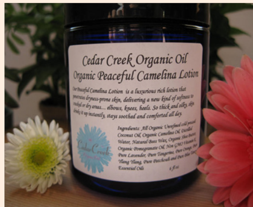
Figure 5: Organic citrus and camelina lotion, a product of Cedar Creek Organic Oil.