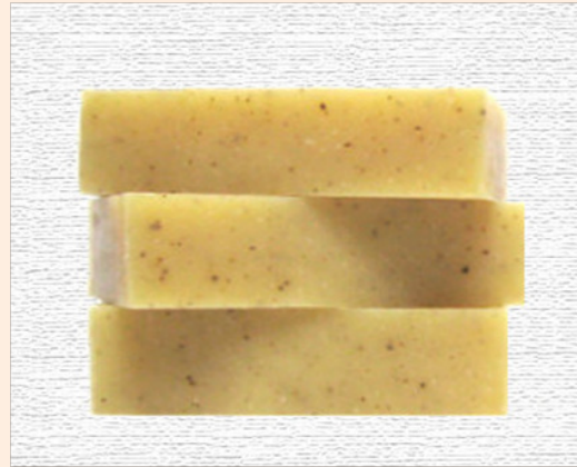
Figure 4: Camelina aloe natural complexion bar soap, a product of Manor Hall Soap Company.