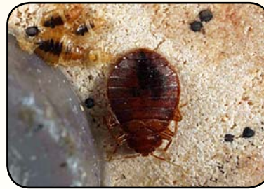
Figure 8. Adult, nymphs and blood spots on the underside of a recliner