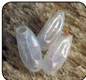
Figure 3. Hatched eggs of bed bugs (G. Alpert, Harvard University, www.Bugwood.org )