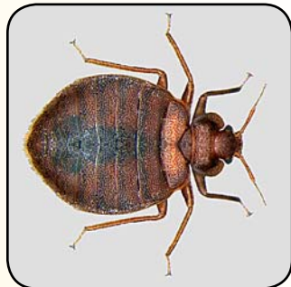
Figure 1. Adult bed bug (P. Beauzay, Dept. of Entomology, NDSU)

Bed bugs belong to the family Cimicidae, which contains many similar species. In our area, bat bugs ( Cimex adjunctus ) and swallow bugs ( Oeciacus vicarius ) are occasionally found in homes. As their names imply, bat bugs attack bats and swallow bugs attack swallows. These species are very similar in appearance to the common bed bug. Therefore, all bed bug identifications should be confirmed by an entomologist. All are blood feeders. The presence of bat bugs indicates the presence of bats roosting in the home, probably in the attic. Swallow bugs can move into the home after the birds have fledged and left their nests. Bat bugs and swallow bugs can and will feed on humans.