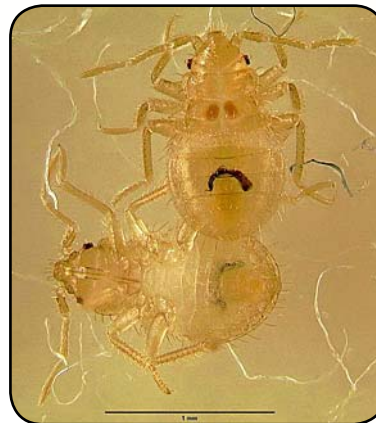
Figure 10. First instar bed bugs caught on a sticky trap