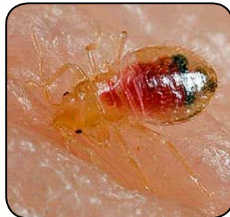
Figure 2. First instar nymph bed bug feeding on human