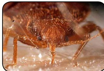
Figure 4. Close-up of bed bug feeding on human