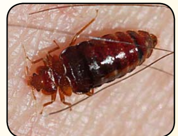
Figure 5. Engorged adult bed bug after feeding