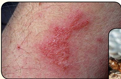
Figure 6. Bed bug bites on human arm causing inflammation

Several types of bed bug traps are available. Sticky traps or glue boards have not been very successful in monitoring for bed bugs (Fig. 10). Because bed bugs are attracted to carbon dioxide and chemical cues