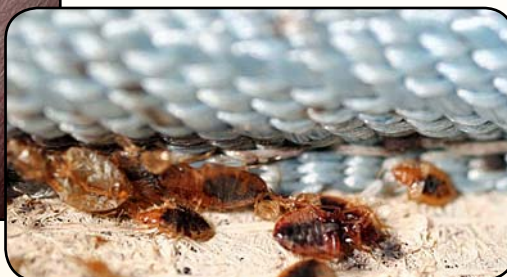
Figure 7. Adult, nymphs and blood spots on fabric of box spring