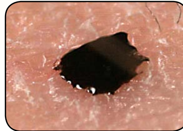
Figure 9. Close-up of bed bug dropping produced after feeding on human