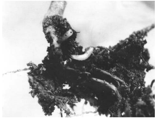
Figure 6. Root maggot larvae feeding on the root of a mustard plant.

Biological Control—Beneficial nematodes (parasitic and entomopathogenic genera Heterorhabditis and Steinernema ) have proven to be effective in reducing root maggots when introduced annually. Enhanced natural populations of rove beetles ( Aleochara sp.) also provide biological control of root maggots. The parasitic wasp, Trybliographa rapae , may provide control when maggots are close to the soil surface. Studies remain inconclusive on use of specific bacteria, such as Bacillus thuringiensis (Bt), to control root maggots. Use of biological control organisms requires careful handling and application and avoidance of most pesticides. Biological controls should be used in combination with other control strategies.