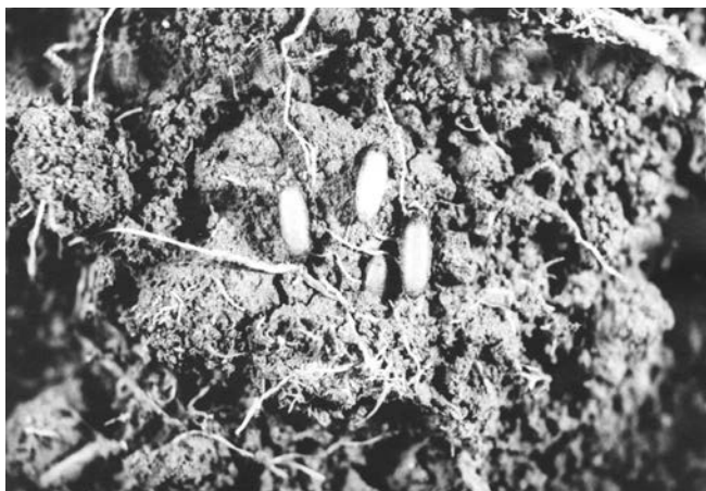
Figure 3. Root maggot pupae (about 1/4 inch in length) in soil.

Several techniques should be combined to provide the most complete protection against root maggots. Several cultural considerations should be considered in root maggot control. Root maggots thrive in organic matter,