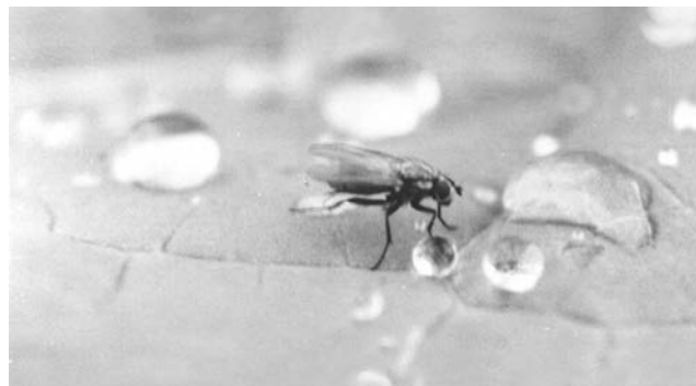
Figure 4. Adult female root maggot fly.

so organic gardening and soils high in organic matter can expect recurrent root maggot problems. The use of diatomaceous earth placed around the base of the seedlings will provide good control with no environmental hazards. Diatomaceous earth (a coarse sand-like particle) should be applied following each rain early in the season.