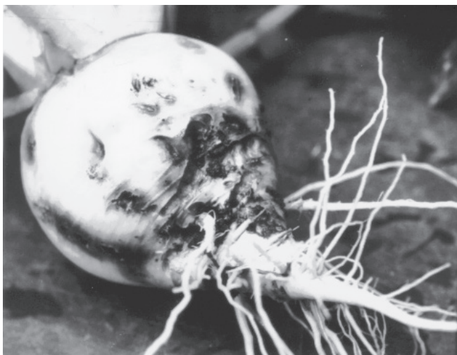
Figure 1. Damage to turnip caused by root maggot larvae. Note the scars of surface feeding and entrances to feeding tunnels within the root.

Feeding by root maggot larvae on the stem, leaf and flowering crucifers (cauliflower, broccoli, cabbage, brussels sprouts and kohlrabi) results in slight to severe decline of