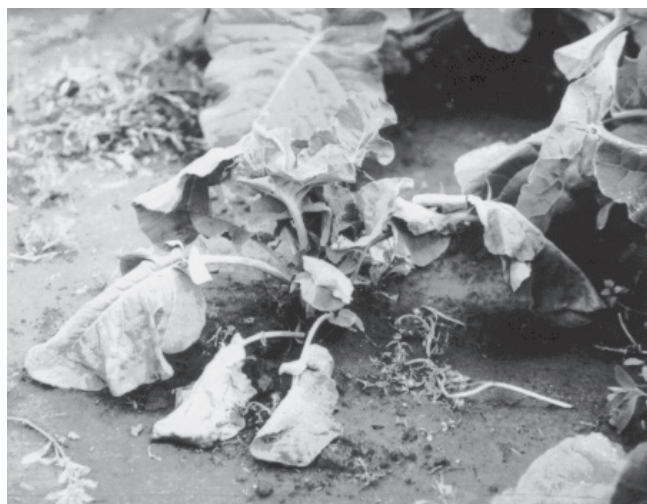
Figure 2. Broccoli plant showing symptoms of root maggot damage.

the plants. The extent of the decline depends on the species of the host (Figure 2). Young plants may be girdled and die. Root systems on older plants may be extensively damaged and the tap root may be destroyed. In wet seasons, the damaged plants may be able to survive because of the production of adventitious roots, if there is a constant supply of water at the soil surface and cool air temperature. If plants survive, yield and quality are reduced. On warm days, the damaged root system cannot support the plant and the plant wilts. If days are warm and surface moisture is low, damaged plants may die.