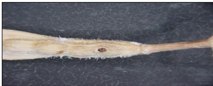
Figure 2. Damaged seed pod by larval feeding

Pheromone based attractants may make monitoring easier in the future. Fungal biocontrol using entomopathogenic (insect killing) fungi may reduce pest populations below threshold levels. These and other strategies are proposed by WTARC in the Spring of 2016.