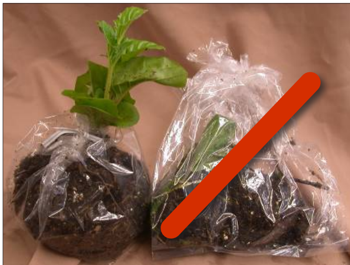
FIGURE 3. Example of a well packaged sample (left) and an insufficient packaged sample (right)