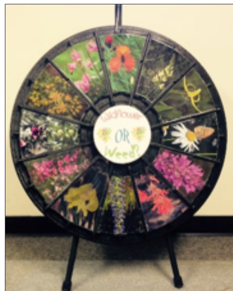
FIGURE 8. Wheel of Weeds.

Hosting a training or event and need a fun invasive plant activity? The Montana Noxious Weed Education Campaign has educational 'Wheel of Weeds' (Jeopardy-like) wheel game boards available for use (Figure 8). These 'Wheel of Weeds' games feature three different inserts: 'Wildflower or Weed?', 'Integrated Weed Management', and 'Fight 5/Why YOU Should Care about Invasive Plants'. If interested in borrowing these fun educational items, contact Jane Mangold at jane.mangold@montana.edu or (406) 994-5513 or Shantell Frame-Martin at shantell.frame@montana.edu or (406) 444-9491.