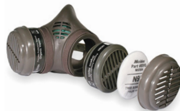
#3 Air Purifying Respirator (APR) with combination chemical cartridge and filter (N, R or P filter)