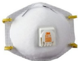
#1 Filtering face-piece respirator (N, R, or P)

Types of Filters and Cartridges. The 'Paraquat Concentrate' product label also calls for the use of particulate filters rated as N (NOT resistant to oil), R (RESISTANT to oil) or P (oil PROOF). N-series filters are not oil resistant, R-series filters are oil-resistant and P-series filters are oil-proof. Filter efficiency is rated as 95, 99 or 100. For example you could have a label that specifies N, R or P filters with an efficiency rating of 100. This is referring to N100, R100 or P100 filters for your respirator. The