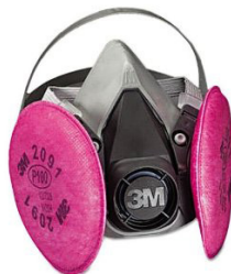
#2 Air Purifying Respirator (APR) with particulate filters (N, R or P)