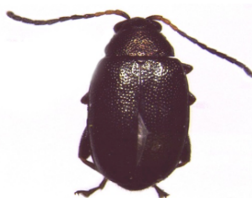
FIGURE 1. Crucifer flea beetle, Phyllotreta cruciferae . Enlarged to show detail.

Insecticide application is the main tactic for flea beetle management on canola, and the majority of canola acreages in North America are treated with insecticides. Classically, insecticide applications are made targeting adults in early spring when the canola crop is at the seedling stage, which is the most susceptible to