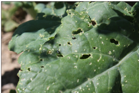
FIGURE 2. Damage to canola leaves caused by flea beetles.

The field experiments conducted by WTARC during 2013 indicated that combined use of entomopathogens (fungi), Beauveria bassiana (2.4 g/liter) and Metarhizium brunneum (5 g/liter) is more effective in reducing feeding injuries and improving yield levels when compared to chemical control and other treatment strategies. This indicates that entomopathogenic fungi are effective against flea beetles and may serve as alternatives to conventional insecticides or seed treatments in managing this pest.