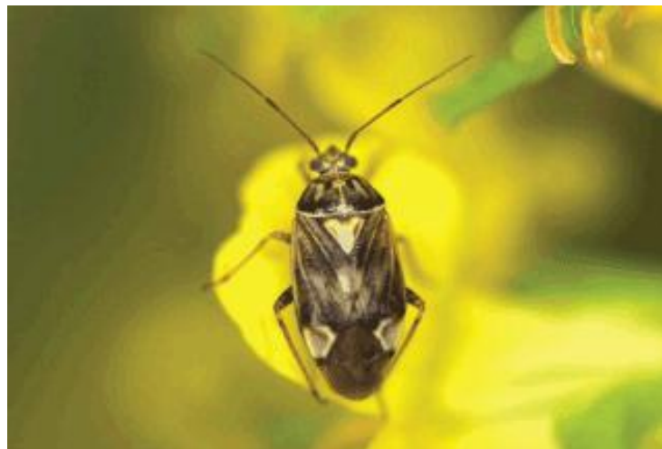
Figure 1: Adult L. lineolaris (5-6 mm long).

Adult: In western Canada, four species Lygus lineolaris (tarnished plant bug), L. borealis , L. elisus and L. keltoni have been observed in canola (Figure 1). Adult lygus bugs are 5-6 mm long and 2.5 mm wide. They vary in color from pale green to reddish brown and have a distinct triangle or "V" shaped mark on the back. Adult lygus bugs overwinter under litter, debris, or plant cover in shelterbeds, headlands and field margins. In the spring adults become active and feed on early-growing plants. Lygus bugs utilize a wide range of host plants that are available sequentially through the season. Adults start to lay eggs in mid-May in the southern prairies and in mid-June in the Peace River region. Eggs are inserted individually into the stems (Figure 2) and leaves of host plants. Egg laying usually lasts 3 weeks but may continue for up to 7 weeks and may vary depending upon the host crop and duration of the growing season.