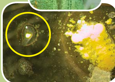
Figure 15. Dissected parasitoid larva (circled) that was developing inside the wheat midge larva. (Anderson, Department of Entomology, NDSU)