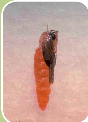
Figure 5. Pupa of wheat midge. (Saskatoon Research Centre, Canada)