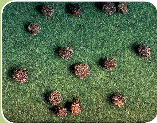
Figure 4. Cocoon of wheat midge.