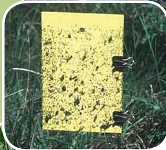
Figure 12. Yellow sticky trap used to monitor for adult wheat midge.