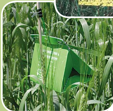
Figure 13. Sex pheromone trap used to monitor for adult wheat midge.