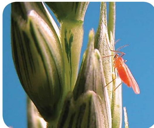
Figure 1. Adult wheat midge.

The adult wheat midge is an orange-colored, fragile, very small insect approximately half the size of a mosquito. It is about 0.08 to 0.12 inch (2 to 3 millimeters) long with three pairs of long legs. It has a pair of wings, which are oval, transparent and fringed with fine hairs. Two eyes are conspicuous and black.