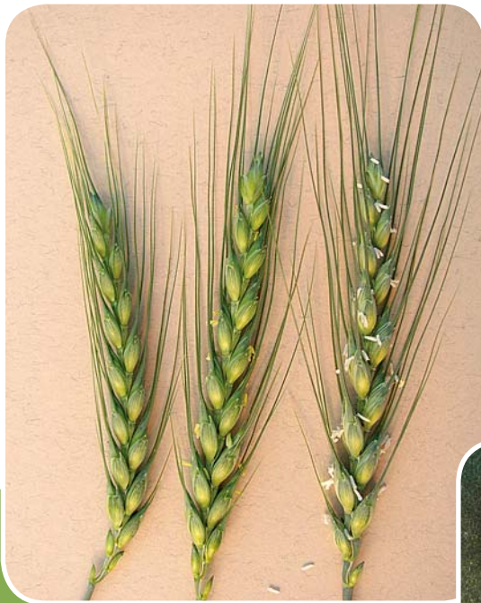
Figure 7. Crop stages of hard red spring wheat – heading (left), early flowering (center) and late flowering (right).

Based on North Dakota field observations, wheat midge larval infestations were the greatest when heading occurred during peak female emergence (1,475 degree days). Wheat midge degree days (DD) are based on