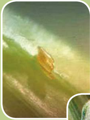
Figure 2. Egg of wheat midge. (Saskatoon Research Centre, Canada)