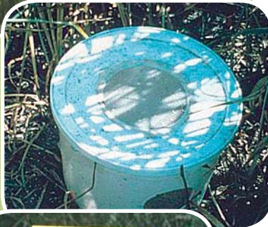
Figure 11. Emergence trap used to monitor for adult wheat midge.