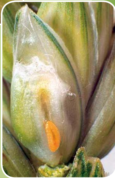
Figure 3. Larva of wheat midge in wheat kernel.