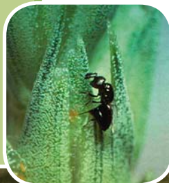
Figure 14. Parasitoid, Macroglenes penetrans , of wheat midge. (Saskatoon Research Centre, Canada)