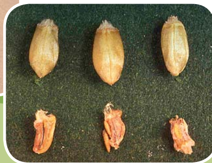
Figure 8. Comparison of healthy (top) and damaged (bottom) wheat kernels from wheat midge feeding injury. (Saskatoon Research Centre, Canada)

Although DD are useful in predicting development of many insect species, these predictions are only estimates. The accuracy of a DD estimate is dependent on the temperatures used in calculating DD. Degree days