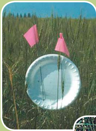
Figure 10. White plastic foam plate (trap) used to monitor for adult wheat midge. (Knodel, Department of Entomology, NDSU)