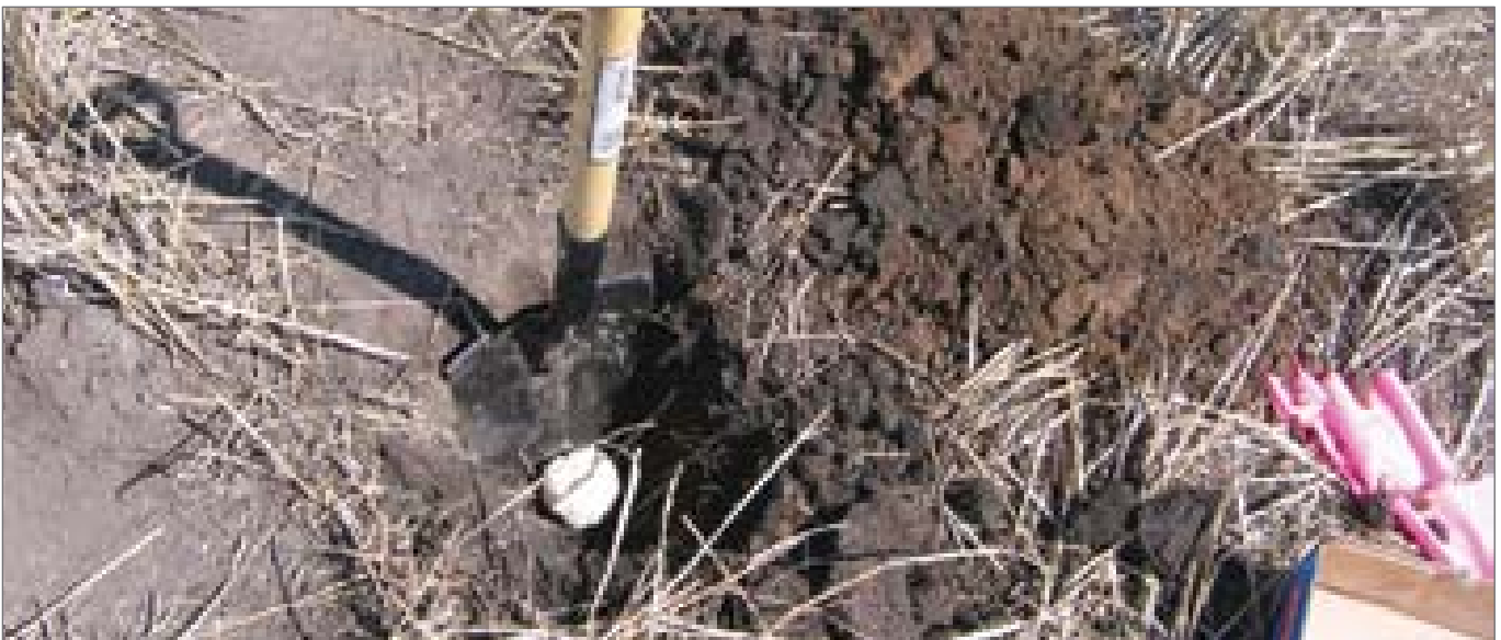
About 20 bait balls per acre should be buried 4 to 6 inches deep