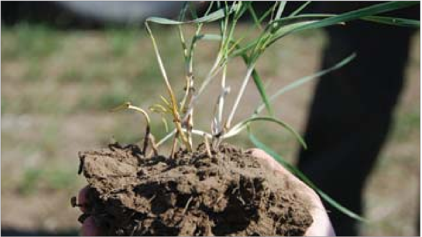
Shredding and discolouration typical of wireworm feeding