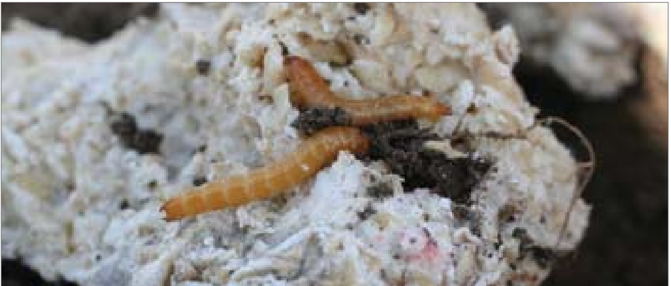
Bait balls attract wireworms by releasing CO 2

Bait balls are not always fool proof. If wireworms are sufficiently fed, they will not be attracted by the presence of a new food source and will not go to the trap. If the ground has recently been tilled and is rife with CO 2 sources, they will not go to the trap. Still, bait balls are the best means of determining the extent of a wireworm problem and are an excellent assessment tool.