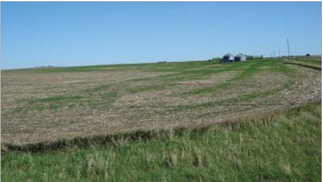
Severe wireworm damage can result in no crop stand at all