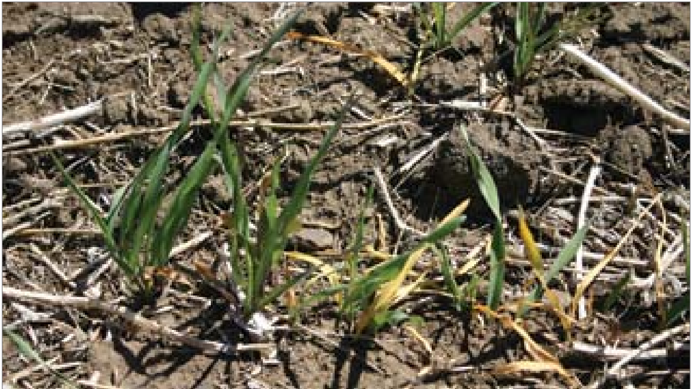
Wilting and discolouration along a seed row can indicate wireworm damage