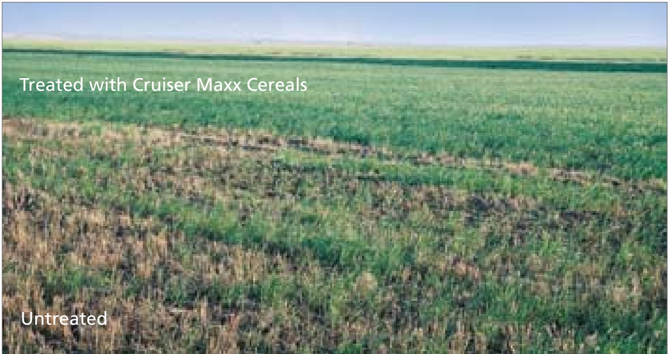
Insecticidal seed treatment is an effective way to protect crops from wireworms